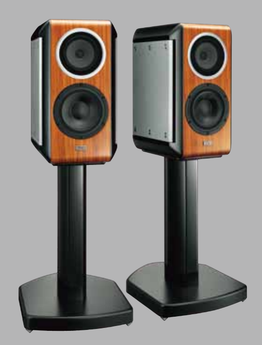
Compact Evolution One