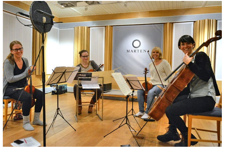
Sjöströmska kvartetten at the Marten state-of-the-art studio designed by SMT

A CD called Supreme Sessions will be published in 2014.